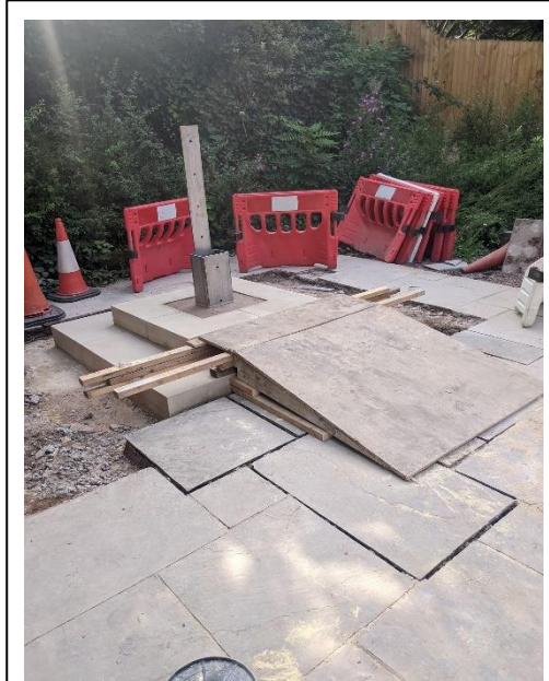
Work in progress on re-installing the War Memorial

As of 24 th July 2024, work took place to re-install the Albrighton War Memorial to the original site following essential and vital refurbishment works on the structure and surroundings. This project has been in the works since 2022 and has been a long laborious project for Albrighton Parish Council and its War Memorial Working Group. The project was estimated at approx. £50,000, of which Albrighton Parish Council and its working group ensured that it sought donations and grants from a variety of sources to ensure that it did not need to significantly increase the Council's precept through Council Tax for local residents. We currently await the final bill for this work and will update members of the public when this has been finalised.