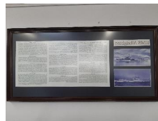
History of HMS Albrighton